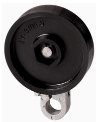
Actuating roller lever, IP65, 50 mm, I 37.5 mm

Part no. HR418 Catalog No. 014884 Alternate Catalog No. HR418