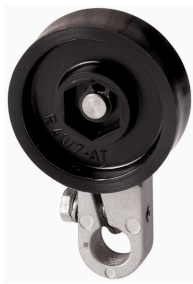
Actuating roller lever, IP65, 40 mm, l 37.5 mm

Part no. HR417 Catalog No. 012511 Alternate Catalog No. HR417