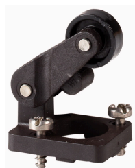
Roller lever for AT0.

Part no. AR-AT0 Catalog No. 046026 Alternate Catalog No. AR-AT0