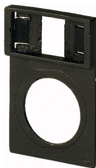
Label mount, black

Part no. Q25TS-X Catalog No. 036601 Alternate Catalog No. Q25TS-X